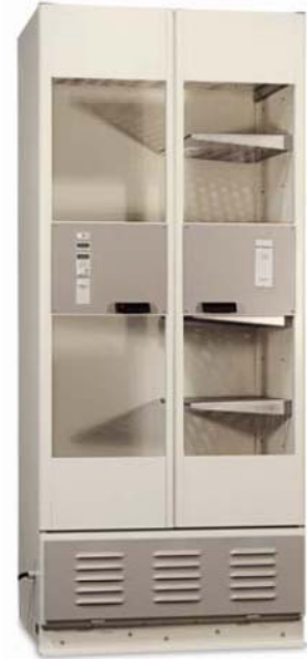
Model 330 Configuration with Half-Width Shelving Option

Two year warranty covers 100% of parts and labor, with an optional Extended Warranty Plan (parts only) available. Toll-free technical assistance for the lifetime of the equipment. Warranty service is provided through Medical Equipment Repair Association (MERA) or through in-house biomedical staff.