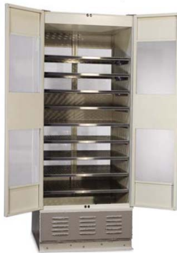
Model 340 with Maximum Full-Width Shelving Option