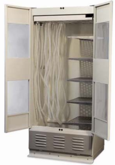
Model 330 with Half-Width Shelving and Bag & Bottle Rack Options