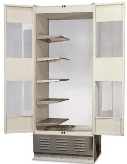
Model 340 Configuration with Half-Width Shelving Option