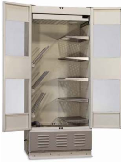
Model 330 with Half-Width Shelving and Bag & Bottle Rack Options