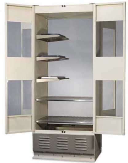
Model 340 with Half-Width & Full-Width Shelving Option and Small Parts Trays Options