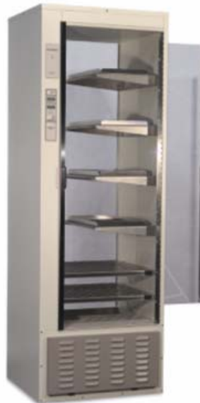
Model 136 with Half-Width & Full-Width Shelving and Small Parts Trays Options