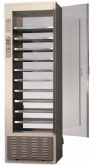
Model 136 with Maximum Full-Width Shelving Option