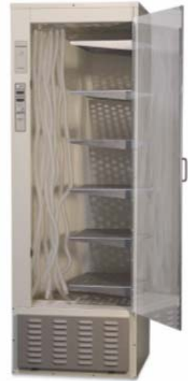
Model 135 with Half-Width Shelving and Tube Drying Rack Options