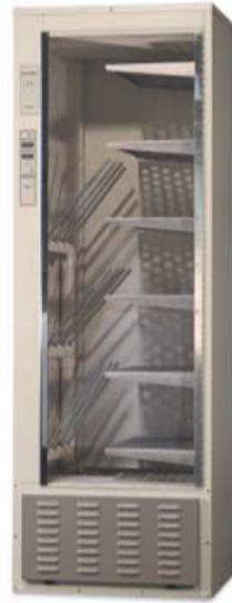
Model 135 with Half-Width Shelving and Bag & Bottle Rack Options