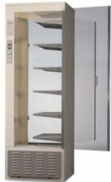
Model 136 Configuration with Half-Width Shelving Option