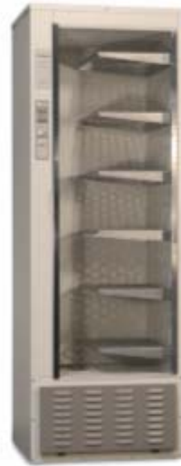
Model 135 Configuration with Half-Width Shelving Option

Two year warranty covers 100% of parts and labor, with an optional Extended Warranty Plan (parts only) available. Toll-free technical assistance for the lifetime of the equipment. Warranty service is provided through Medical Equipment Repair Association (MERA) or through in-house biomedical staff.